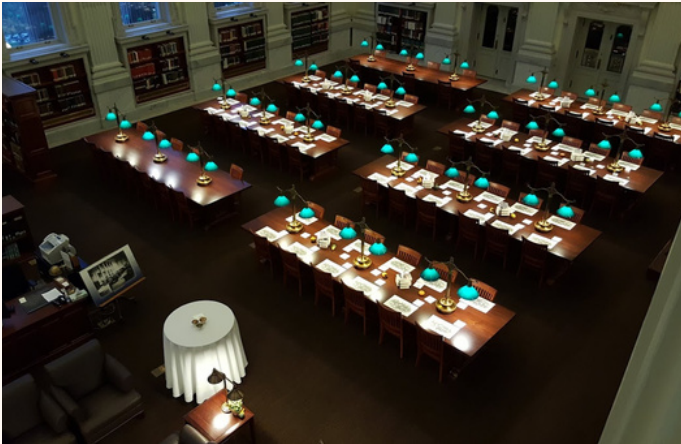
READING ROOM LIBRARY